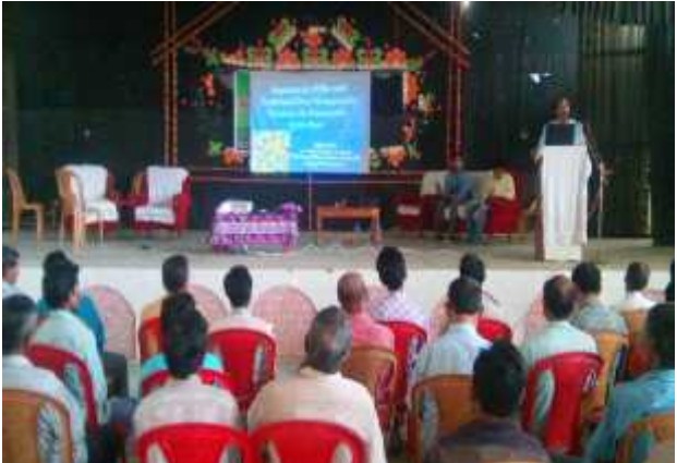
Report of awareness programme on Various Educational & Career Scope

During the academic session 2016-2017 , the Cell has organized two programmes in the college for the benefit of the students.